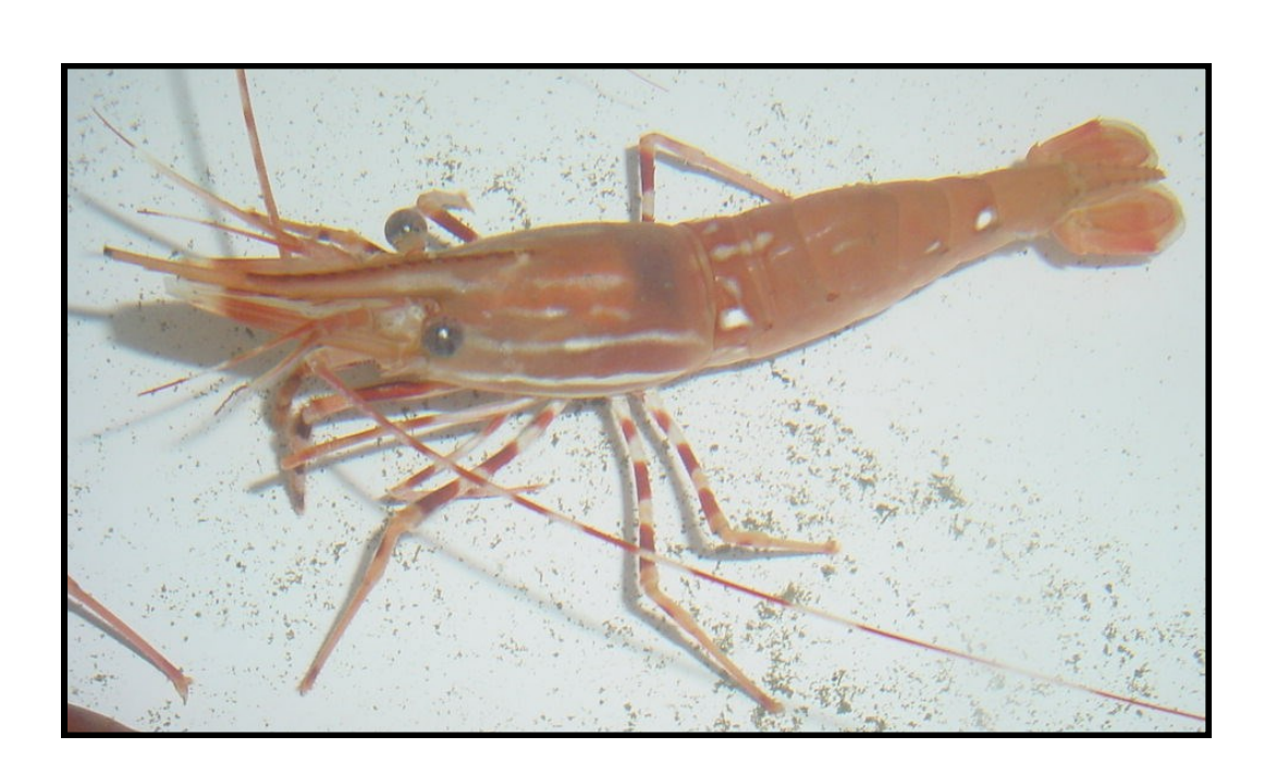
Figure 2. Photograph of the spot shrimp Pandalus platyceros. Note the spots on its abdomen that inspire its name.

Hemisquilla individuals were captured by otter trawl at 30 m depth off Santa Barbara, California in September 2003. All individuals were maintained in a recirculating salt water aquarium with artificial seawater. All animals were kept separate from each other and given a PVC pipe to simulate a burrow. Water salinity was kept between 32-35 ppt, pH was maintained between 8.0-8.2, and nitrate levels were controlled via carbon filtration and water exchange. The tank was kept at 16°C on a 14:10 light:dark cycle to simulate their natural habitat. Individuals were fed shrimp or salmon three times a week and were all allowed to acclimate for at least 10 days prior to any testing. Pandalus platyceros, the spot shrimp, which is of similar size but does not live in burrows, will be used as a control. P. platyceros specimens were captured at 80 m depth by otter trawl off San Juan Island, WA, and maintained at the ambient temperature of 11°C in seawater tables at the Walla Walla College Marine Station. P. platyceros is an epibenthic species and so is unlikely to encounter anoxia.