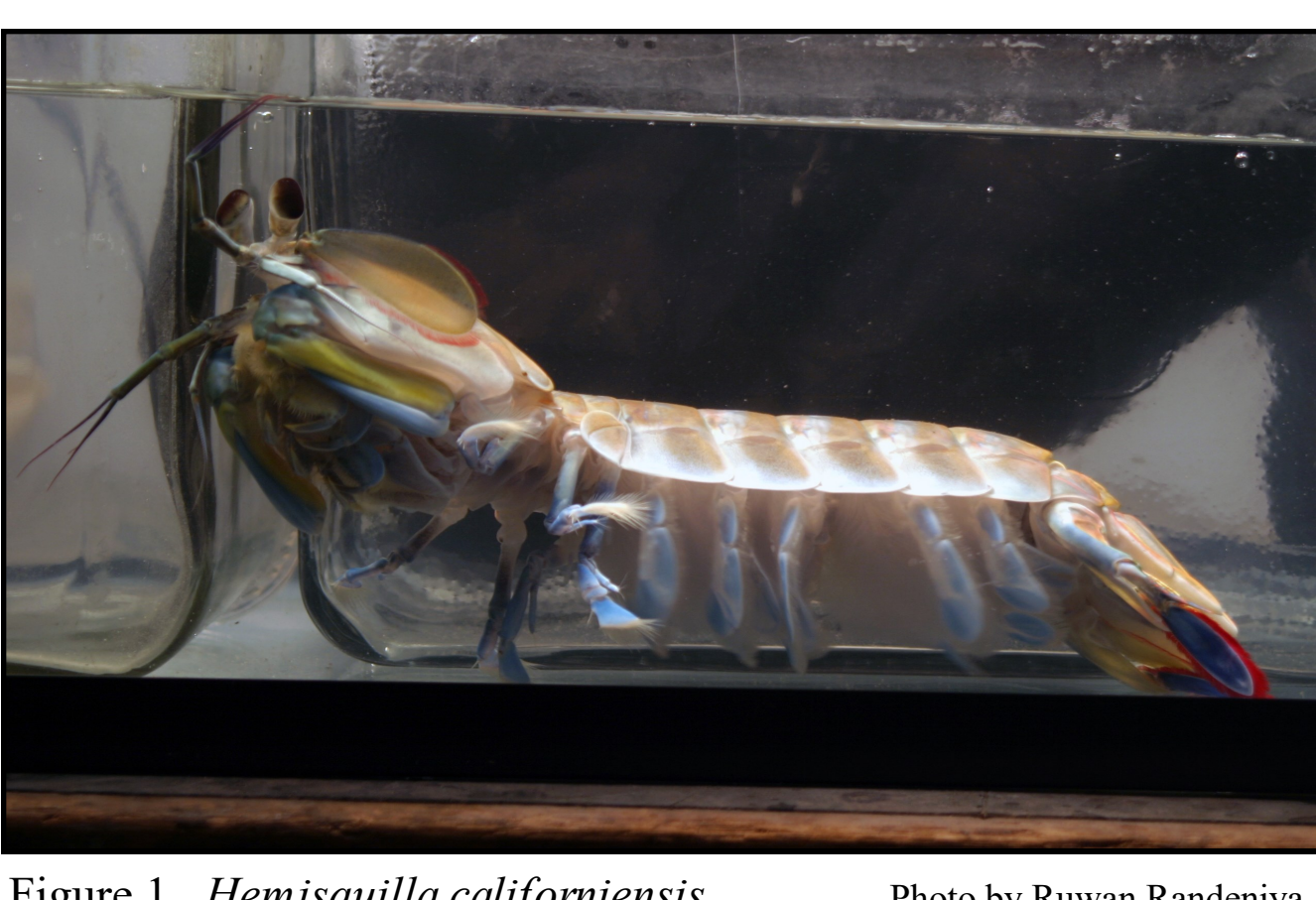
Figure 1. Hemisquilla californiensis.

depths ranging from 4-90 m. While active, animals may sit at the burrow entrance or move around the surrounding area. During inactive periods, individuals will cap their burrow with a sand plug and remain inside for extended periods of time. Within the sealed burrow, oxygen levels rapidly deplete within 2-3 hours while activity levels, such as movement and pleopod beating, remain constant and high (Cowles, 2004). Studies have shown that Hemisquilla is a poor oxyregulator, but can survive at least 52 hours of anoxia (Peters, 1997).